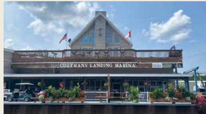
FEATURED PROJECT: Coeymans Landing Marina Coeymans, NY