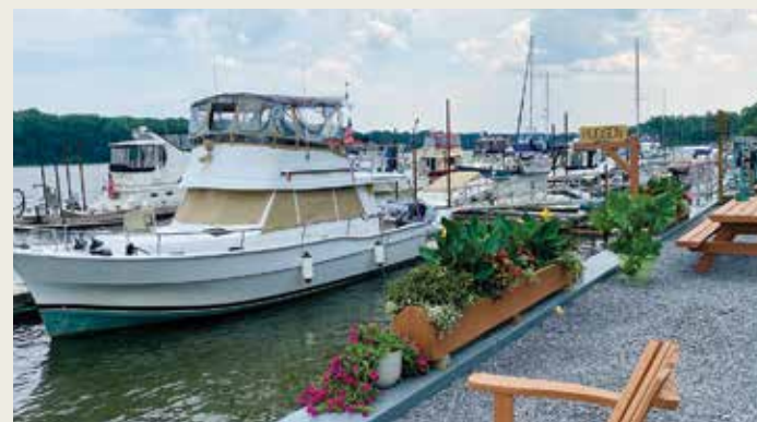
FEATURED PROJECT: Crescent Woods Clifton Park, NY